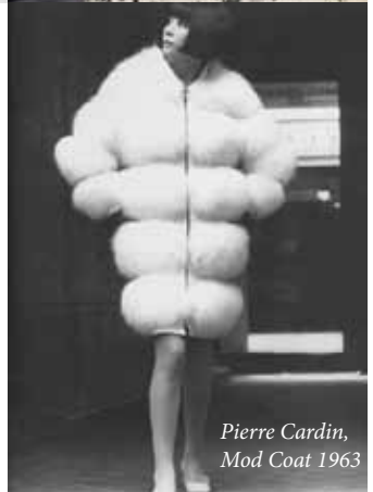
Pierre Cardin, Mod Coat 1963