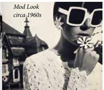
Mod Look circa 1960s